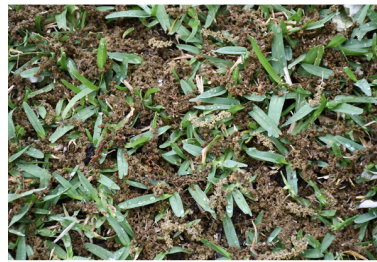
Live Oak pollen