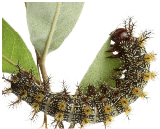
Buck Moth Caterpillar