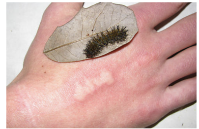
Ten minutes later